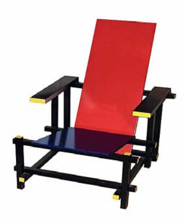
Fig. 3 Red and Blue Chair (1917), designed by Gerrit Rietveld

The first three-quarters of the twentieth century are often seen as the march towards Modernism. Born from the Bauhaus and Art Deco/Streamline styles came the post WWII "Mid-Century Modern" style using materials developed during the war including lamenated plywood, plastics and fiberglass. Transitional furniture is intended to fill a place between Traditional and Modern tastes.