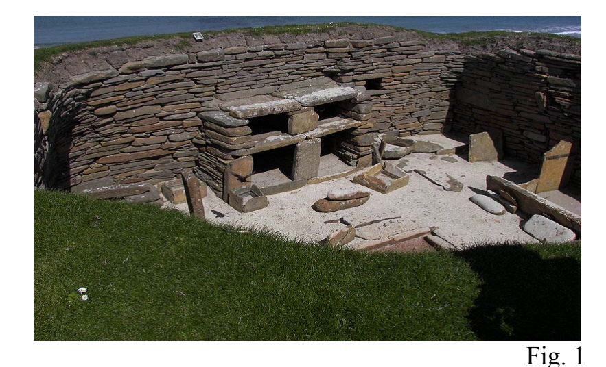
Skara Brae house Orkney Scotland evidence of home furnishings i.e. a dresser containing shelves

A range of unique stone furniture has been excavated in Skara Brae, a Neolithic village located in Orkney. The site dates from 3100–2500 BC and due to a shortage of wood in Orkney, the people of Skara Brae were forced to build with stone a readily available material that could be worked easily and turned into items for use within the household. Each house shows a high degree of sophistication and was equipped with an extensive assortment of stone furniture, ranging from cupboards, dressers and beds to shelves, stone seats, and limpet tanks. The stone dresser was regarded as the most important as it symbolically faces the entrance in each house and is therefore the first item seen when entering, perhaps displaying symbolic objects, including decorative artwork such as several Neolithic Carved Stone Balls also found at the site.