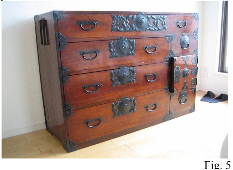
Sendai-dansu for kimono has the elaborate ironwork, handles on side for transportation, and lockable compartment.

Asian furniture has a quite distinct history. The traditions out of India, China, Pakistan, Indonesia (Bali and Java) and Japan are some of the best known, but places such as Korea, Mongolia, and the countries of South East Asia have unique facets of their own.