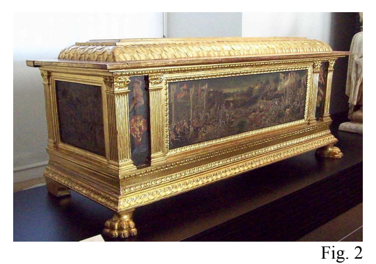
Florentine cassone from the 15th century

The furniture of the Middle Ages was usually heavy, oak, and ornamented with carved designs. Along with the other arts, the Italian Renaissance of the fourteenth and fifteenth century marked a rebirth in design, often inspired by the Greco-Roman tradition. A similar explosion of design and renaissance of culture in general, occurred in Northern Europe, starting in the fifteenth century. The seventeenth century, in both Southern and Northern Europe, was characterized by opulent, often gilded Baroque designs that frequently incorporated a profusion of vegetal and scrolling ornament. Starting in the eighteenth century, furniture designs began to develop more rapidly. Although there were some styles that belonged primarily to one nation, such as Palladianism in Great Britain or Louis Quinze in French furniture, others, such as the Rococo and Neoclassicism were perpetuated throughout Western Europe.