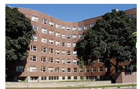
Detail of Baker House facade on the Charles River