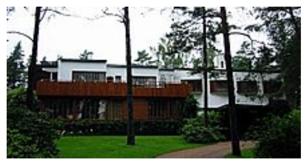
₽Villa Mairea in Noormarkku