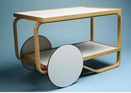
₽Tea cart (tea trolley)