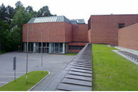
➡Main Building of the Jyväskylä University (1955) 49