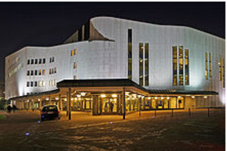
The Aalto-Theater opera house in Essen, Germany