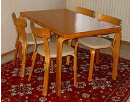
Table and chairs designed by Alvar Aalto

SKUNSTEN Museum of Modern Art Aalborg, Denmark (1958–72)